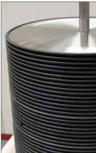
TREIF blade manufacturing is quality in series production.

Feel free to contact us – as your partner for the optimum cutting process we are happy to provide advice!