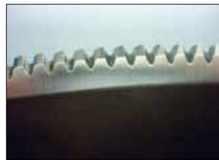
The TREIF regrinding service gives the blade its tothing back. The micro tothing is recreated rather than just ground.